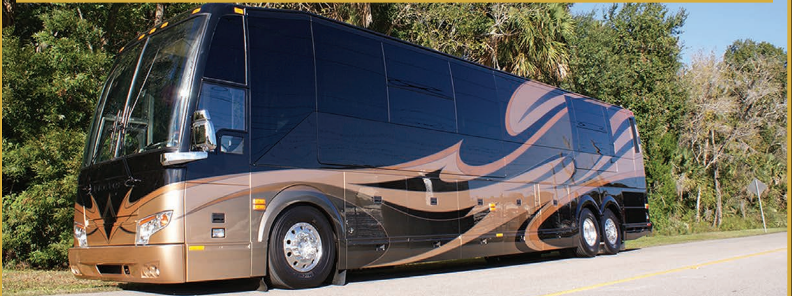
2016 Millennium H3-45 S4 #10103