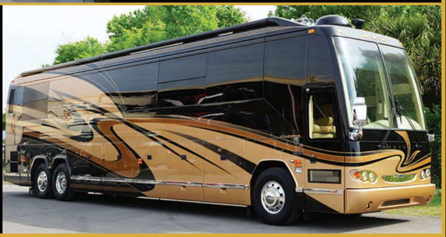
2007 Millennium H3-45 S2 #0603