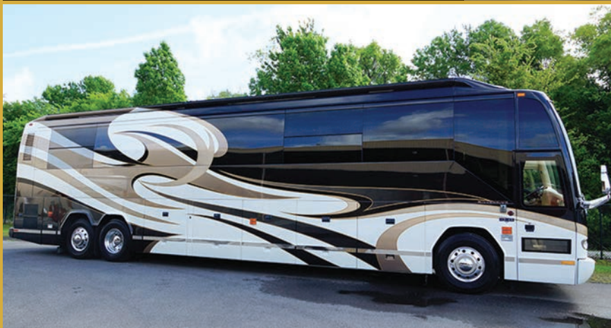
2008 Millennium H3-45 S2 #0606