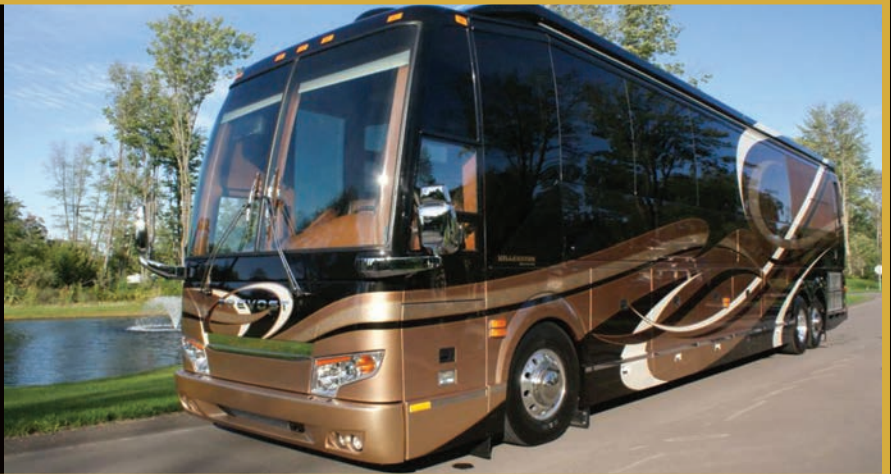
2012 Millennium H3-45 S3 #0599