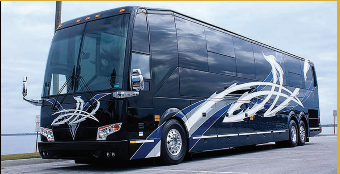
2014 Millennium H3-45 S3 #0595