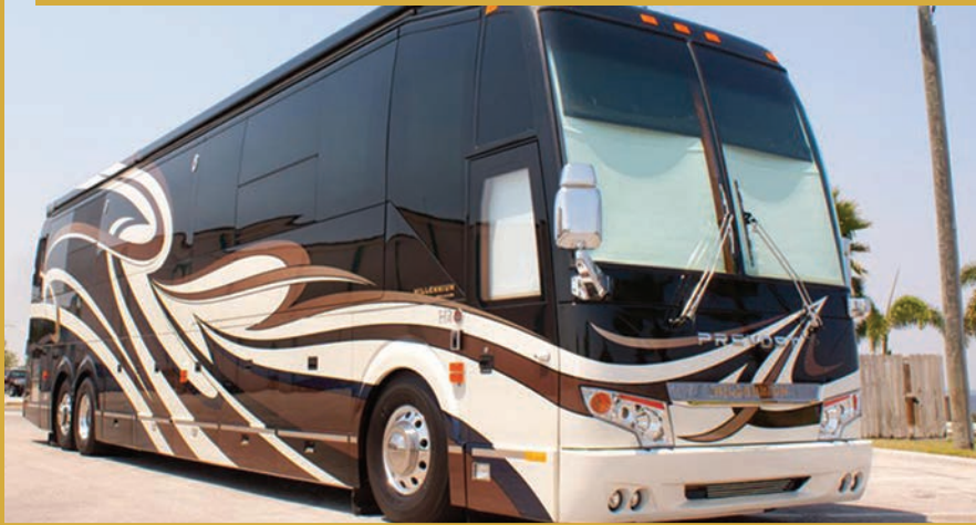
2013 Millennium H3-45 S3 #600