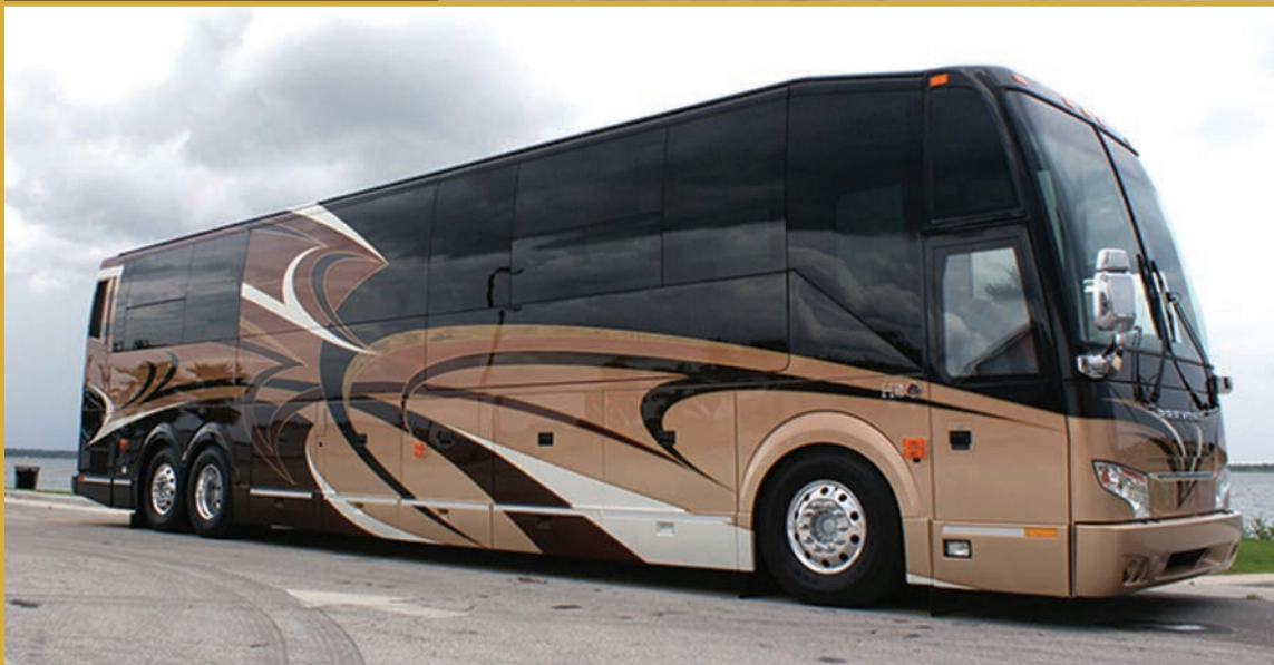
2013 Millennium H3-45 S4 #0602