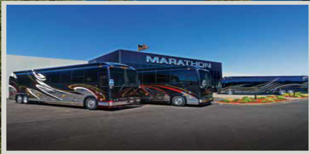
Marathon Coach World Headquarters 91333 Coburg Industrial Way Coburg, Oregon 97408 800-234-9991