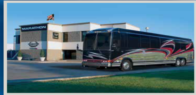
Marathon Coach Texas 1175 Post and Paddock Lane Grand Prairie, Texas 75050 800-448-8881