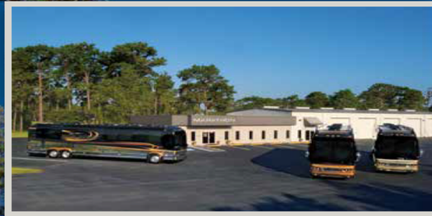
Marathon Coach Florida 11623 Corporate Lake Boulevard San Antonio, Florida 33576 800-437-8295